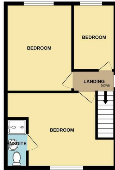
1ST FLOOR 402 sq.ft. (37.3 sq.m.) approx.